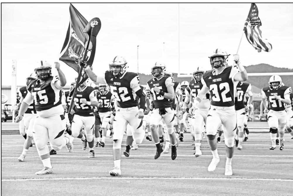
The Panthers take the field prior to their 42-14 victory over Andrews, NC on Friday.

Starting from inside their own 10, the offense quickly found some breathing room with a 24-